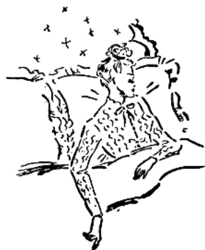
Dainty bed-jacket—with long sleeves or short

ONLY 5 ozs. of 2-ply wool are needed to make this coat—or 4 ozs. if you choose short sleeves; 2 No. 10 knitting needles are also required. Measurements